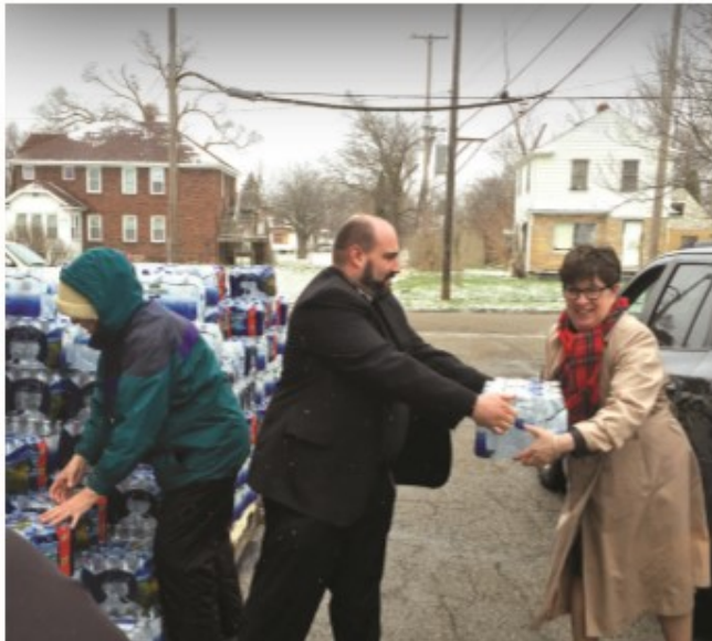
70th Annual Meeting Albert Lea, Minnesota